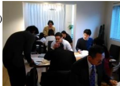
Scene from workshop

• Open symposium: 123 participants (maximum quota). The symposium comprised an explanatory session by the Forestry Agency and introduction to initiatives by corporations (Type I and Type II businesses). A discussion was also carried out on what can be done, and what should be done by individuals toward the quality and effective enforcement of law.