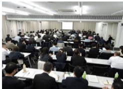
Scene from symposium